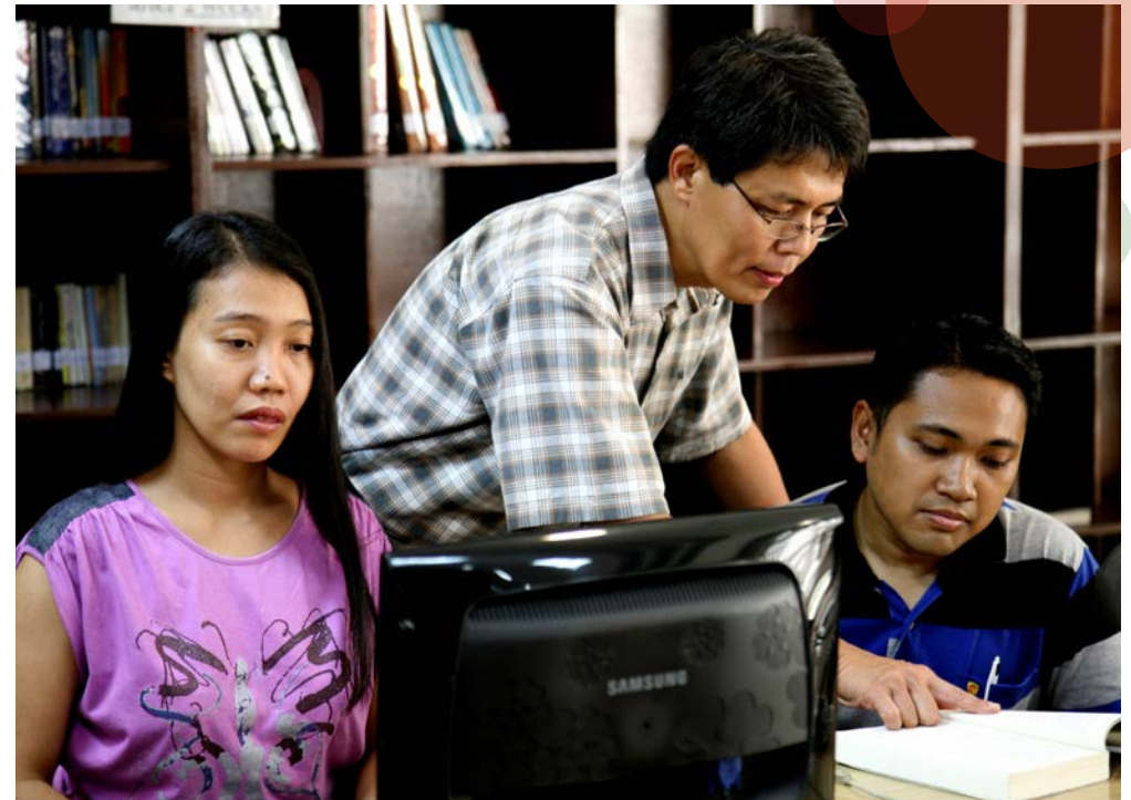
Students studying at Asia Graduate School of Theology, Philippines.