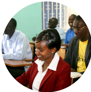
Students at Carlile College, Kenya.

We are pleased to have the ongoing support for over 200 students. Our supporters gave over $258,000 to student sponsorships. College principals often say how much they appreciate these funds, as they facilitate the operational costs of the college. This is because student fees are covered by these donations.