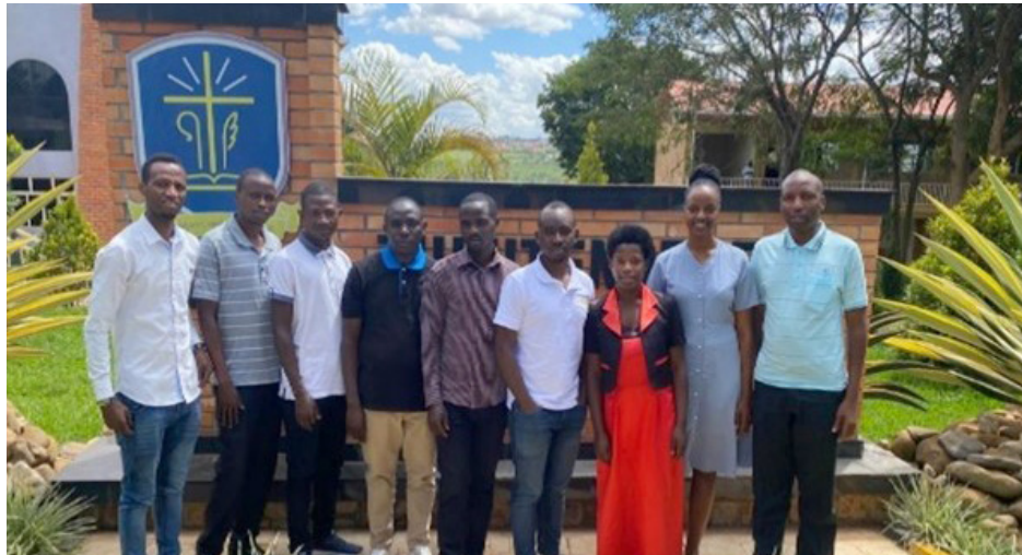
Some of the students at EACC sponsored by supporters of Local Leaders International.

From the bottom of our hearts please accept our deepest thanks for your support.