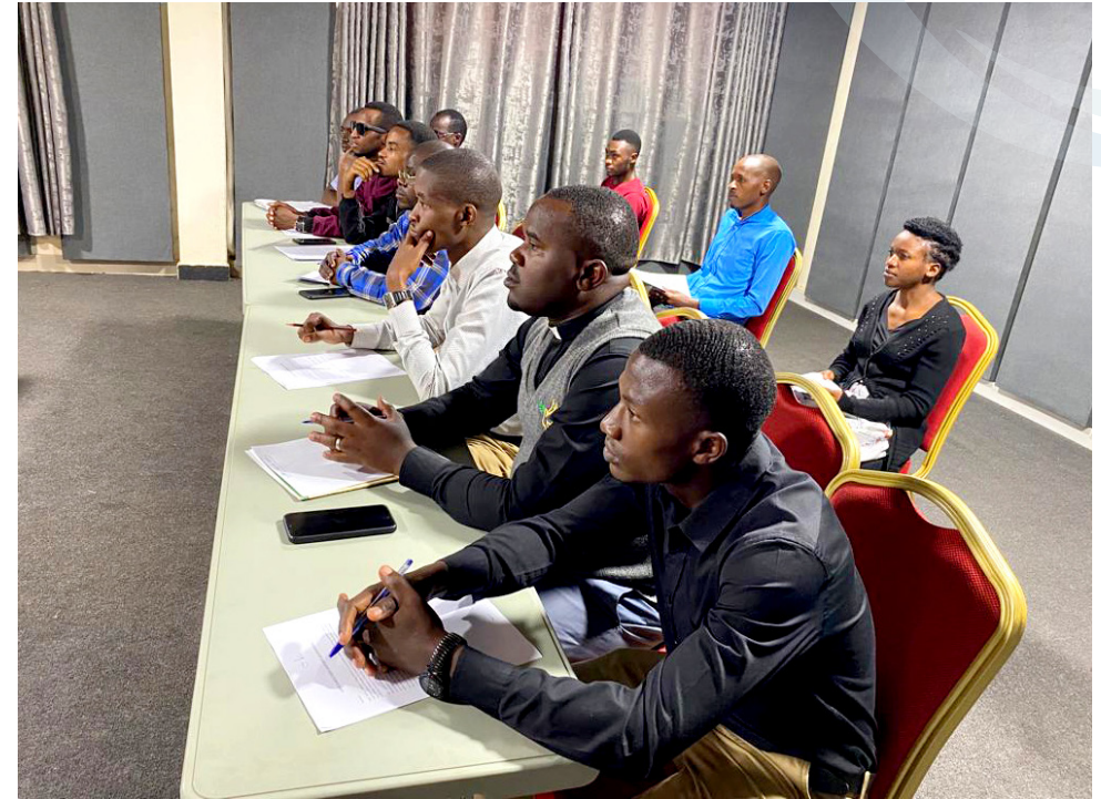
Above and below: Students at EACC are introduced to virtual classes.

For effective practical training, students are attached to Communities of Practice (COPs) where pastors from different areas converge for one to three days to share their experiences and learn through guided peer review mechanisms.