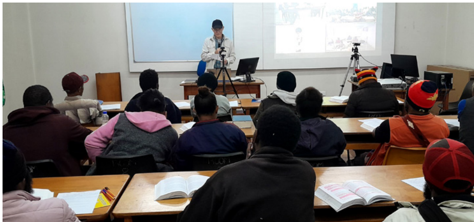
The smart classroom at CLTC Banz campus, Papua New Guinea.

“ Due to the restructuring, the support offered to CLTC through Local Online: A Global Strategy (LOGS) was timely to make teaching across the three campuses successful. ”