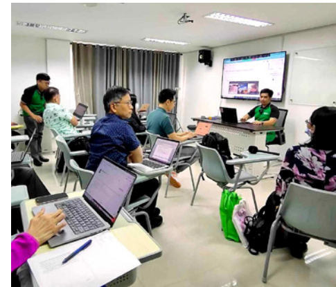
The hybrid classroom at ATS. Faculty members on site and online are receiving training from a faculty champion.

To book your place, head to localleaders.org.au/get-involved/annualdinners